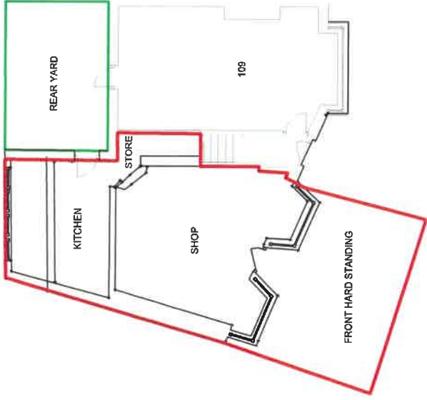
GROUND FLOOR SHOP scale 1:100

m 2m 4m 6m DRAWING SCALE CHECKER 1:100 @ A3